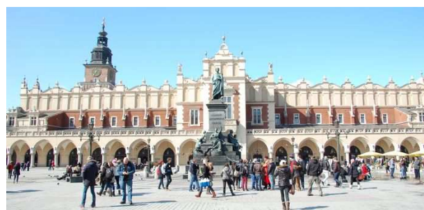
Main Market Square

Cost 20 EUR per person (guide, tickets, transport)