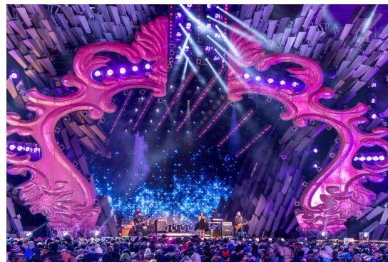
The charms of New Year's Eve Party on the Main Square

Program: concert on the Main Square, fireworks